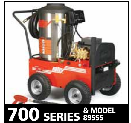
700 SERIES & MODEL 895SS