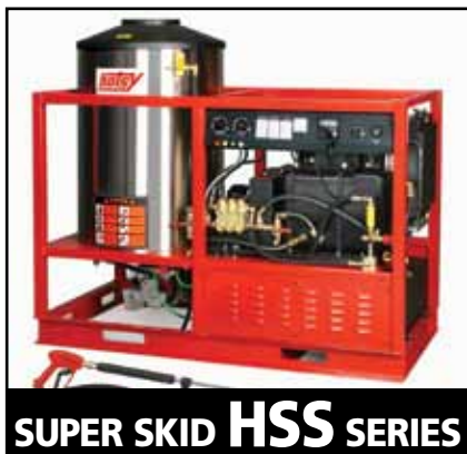
SUPER SKID HSS SERIES