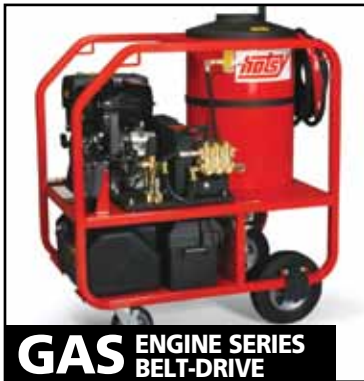
GAS ENGINE SERIES BELT-DRIVE