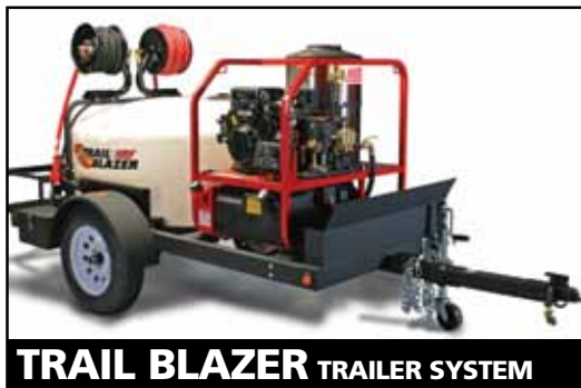
TRAIL BLAZER TRAILER SYSTEM